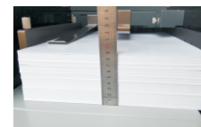
90mm feed volume