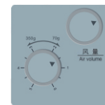
Air volume Adjustment